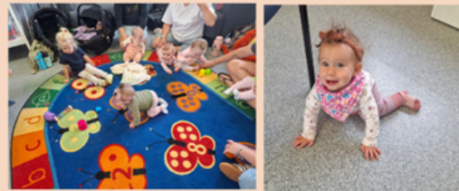
Look at all our little ones